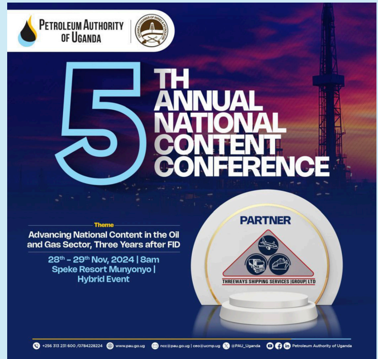
The National Content Conference where TWS was a proud participant and partner.