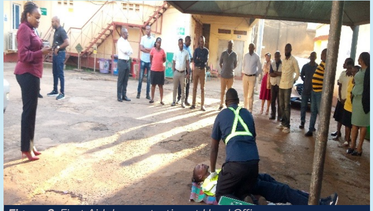
Figure 6: First Aid demonstration at Head Office