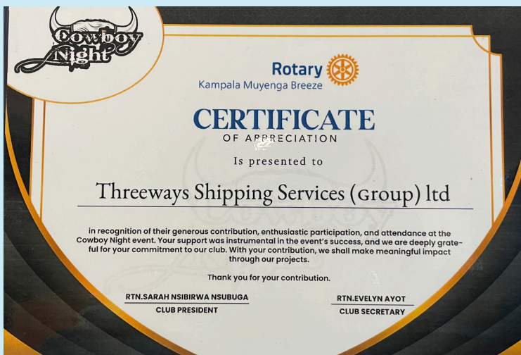
Certificate of Appreciation presented to Threeways Shipping Services (Group) Ltd by Rotary Club, Muyenga Breeze.