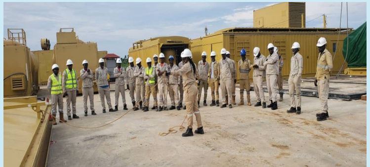
Figure 5: Training on tagline use