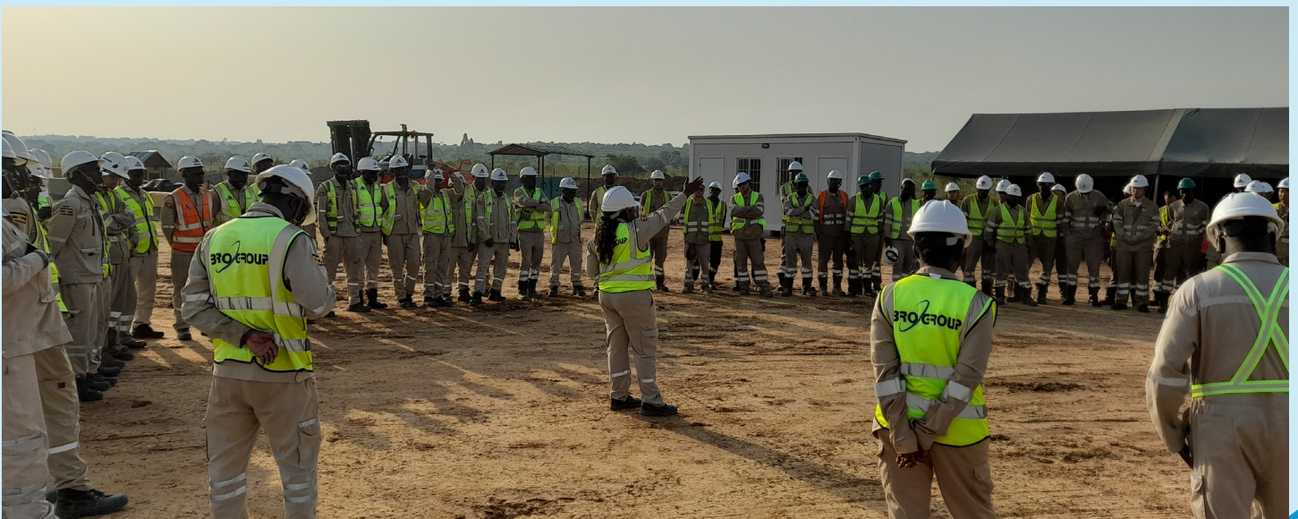
TWS Staff at one of their daily field safety briefings.