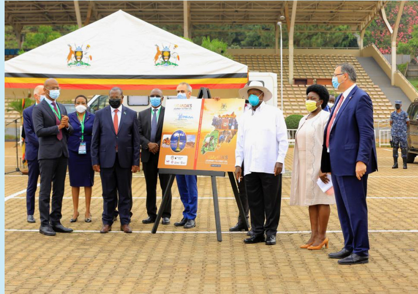
H.E President Museveni at the official FID signing in Kampala.

To be party to this huge opportunity, local companies were told, they needed to invest in building capacity ahead of the FID.