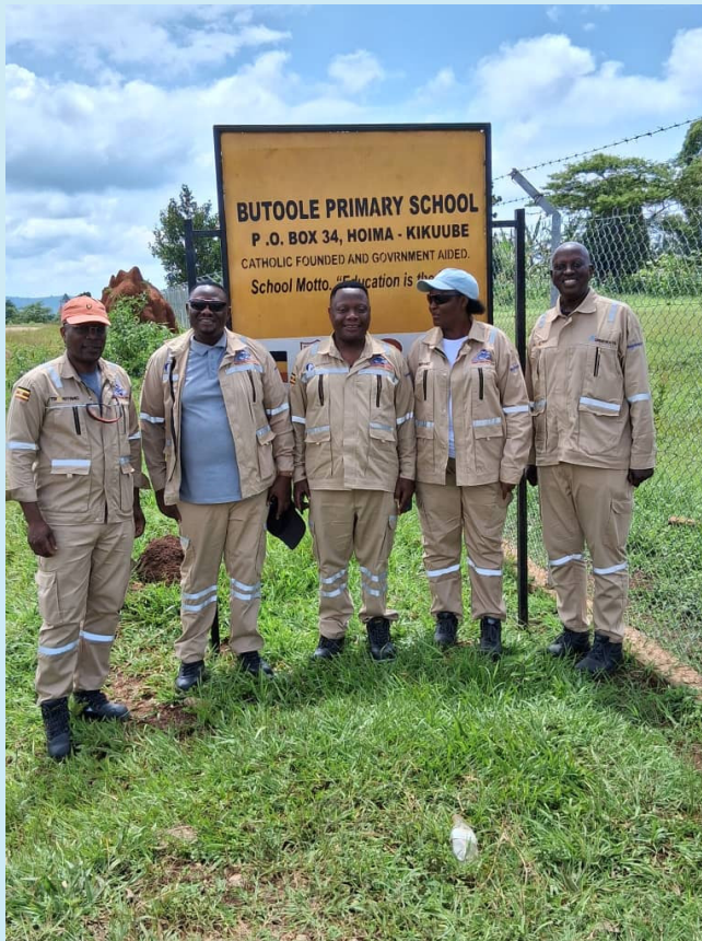
The Board of Governance on a working visit to our operational areas visited Butoole Primary School, our CSR partner.