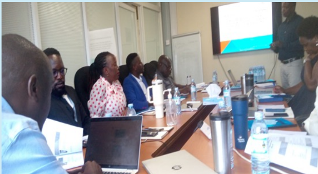
Figure 2: ISO Training

A pictorial of different QHSE events below