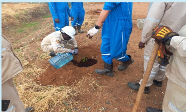
Figure 4: Tree Planting on the World Environment Day