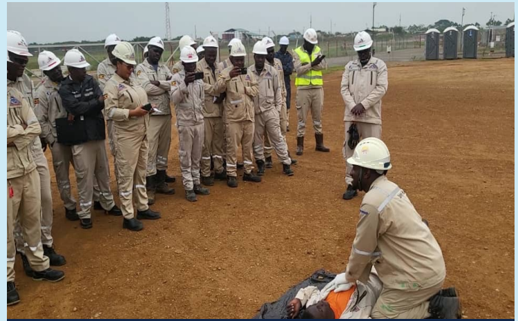
Figure 1: First Aid demonstration on site

These efforts can seek “incremental” improvement over time or “breakthrough” improvement all at once. Delivery processes are constantly evaluated and improved considering their efficiency, effectiveness and flexibility.