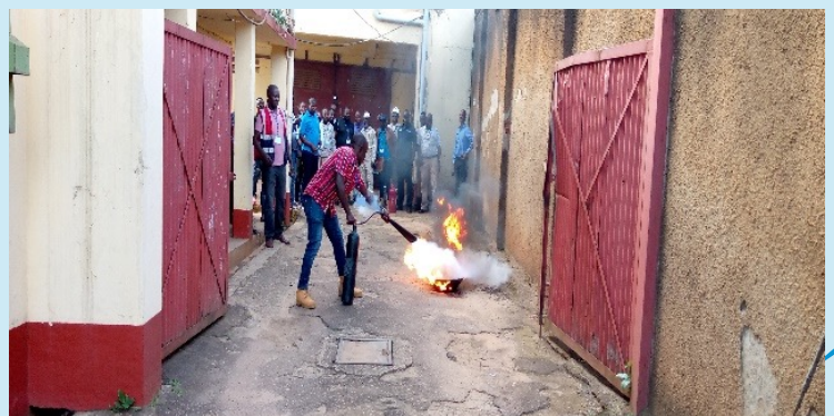
Figure 7: Fire Fighting training at Head Office