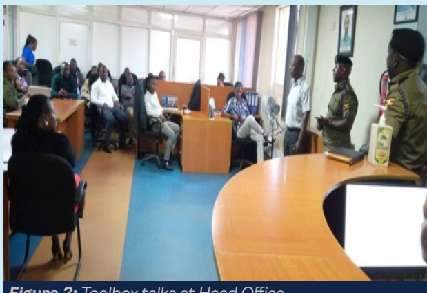
Figure 3: Toolbox talks at Head Office.