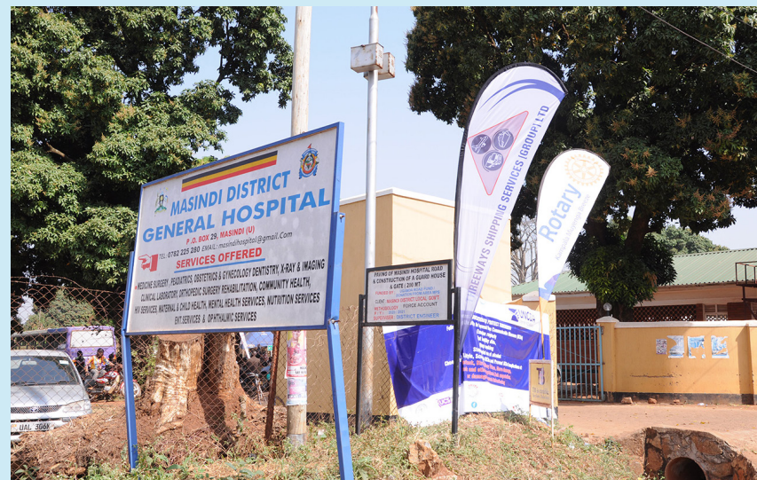
Medical Camp in Masindi in conjunction with Rotary Club Kampala Muyenga Breeze

We are grateful for these opportunities to engage with our stakeholders, promote growth, and give back to our community.